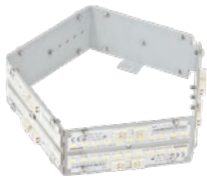
Photo: Palladino LED interior using 10 Philips Fortimo LED Strips 102mm 3600lm - 26W